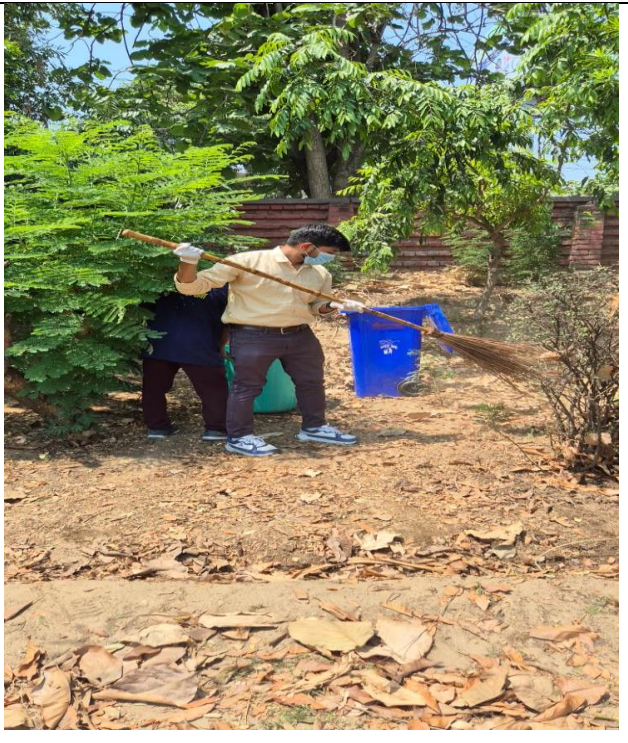
Cleaning drive in the garden area of K.N. Kaul Block, CSIR-NBRI, Lucknow