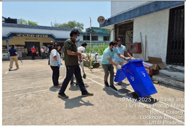
Cleaning drive near the staff club area of K.N. Block, CSIR-NBRI, Lucknow